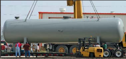
108" x 540" Horizontal Propane Receiver