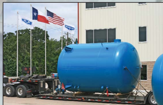
Custom 180" Diameter Vessel