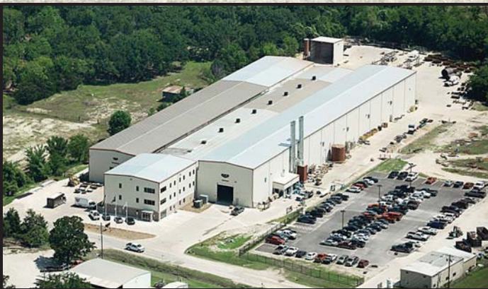
100,000 sq. ft. Manufacturing Facility and Office Complex

RVS is an employee owned company with a dedicated team committed to excellence. RVS partners with industry leading material and component suppliers who share this commitment. Manufacturing superior quality products, providing friendly industry leading service and on-time delivery are what make RVS the specialists in ASME pressure vessels.