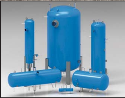
RVS Can Supply Carbon and Stainless Steel Vessels from 4" to 180" Diameter, Various Lengths and Temperature Applications, Packaged Skid Systems Including Controls