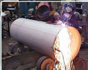
Veteran crew of ASME certified welders and other mechanics form the manufacturing team focused on quality and safety