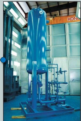
21' W x 25' H x 50' State-of-the-Art Paint Booth with climate control for a professional finish