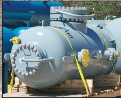
Mercury Guard Bed & Scrubber