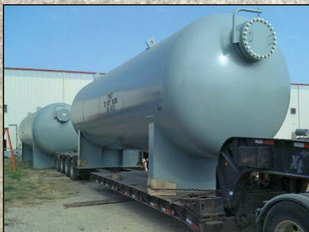
120" x 600" Mixed Refrigerated Surge Drum