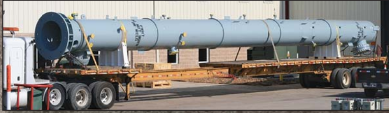
48" x 936" Vertical Contactor Ready for Shipment