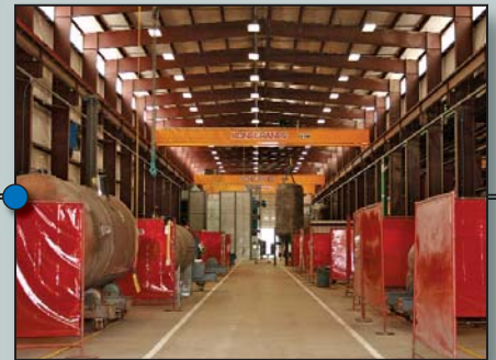
Three manufacturing bays, twenty-nine vessel welding stations and ten overhead cranes with hoist capacity of 100,000 lbs.