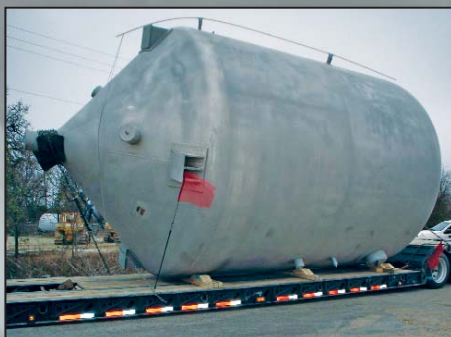
180" Diameter Stainless Steel Cone Head Recirculator