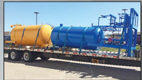
Pump Recirculator Package and High Pressure Receiver in IAR 2 Spec Colors