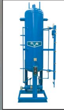
Intercooler and Accumulator Packages