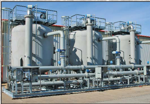
Water Filtration Skids