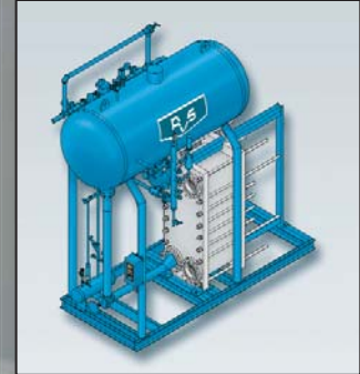
Plate and Frame Chiller Packages