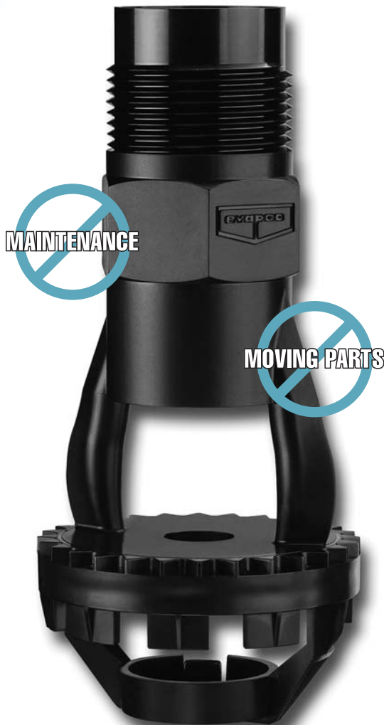
ZM II ® Spray Nozzle

EVAPCO is proud to introduce the NEW ZM II ® Spray Nozzle —the latest advancement in Zero Maintenance nozzle technology. The ZM II ® Spray Nozzle has been updated with a more robust design for greater durability and a new configuration for enhanced water droplet formation. The unique design features of the ZM II ® Spray Nozzle eliminate the need to repair or replace spray nozzles.